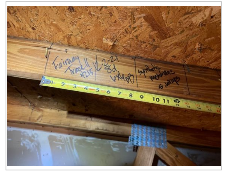
Spacing 8d Nails