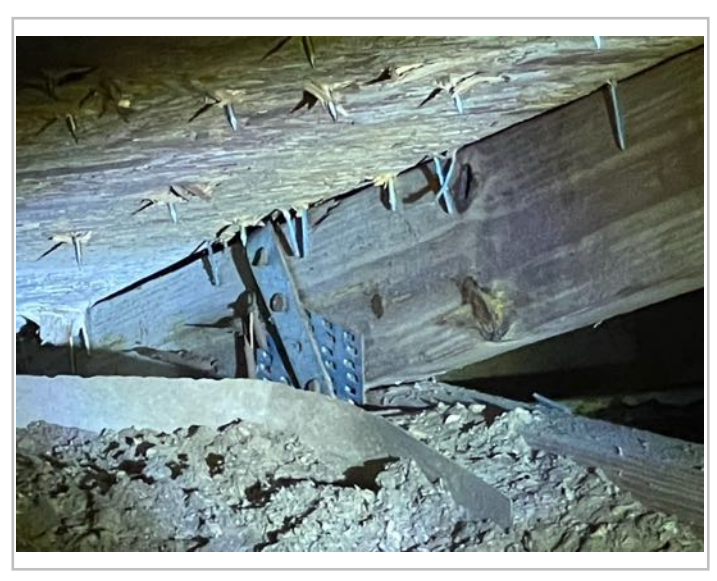
Strap- Opposing Side