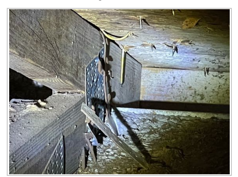
Strap- Anchor Side